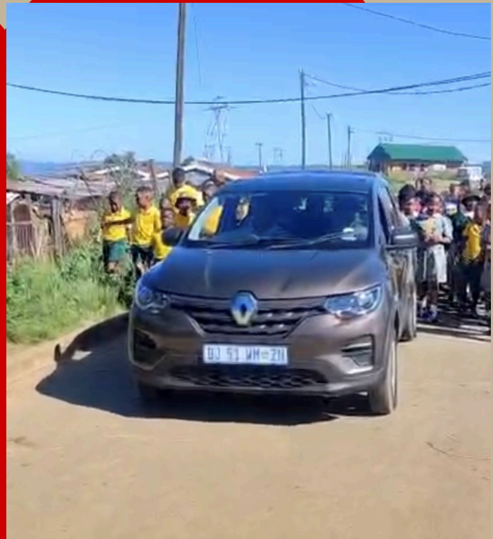
Pictured above: The new car arriving at the school escorted by cheering, singing dancing and ulatating students!